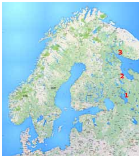
Figure 1. North West Russia has three important petroglyph areas with several depicting beluga whales. 1= Lake Kanozero, 2= Vyg River and 3= Lake Kanozero