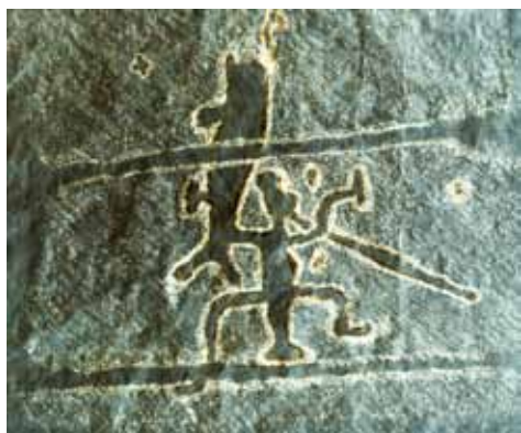
Figure 3. Vyg River. A beluga whale at the surface of the sea and a human-whale hybrid. Rubbing: Jim Nollman. Photo: Rauno Lauhakangas, 2000.

(1997: 245), where I had read a poem transcribed by Lönnrot.