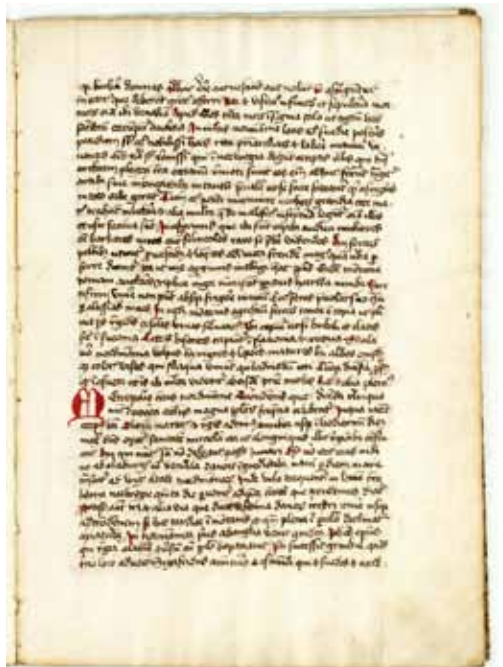
Figure 4. Adamus Bremensis, Description insularum Aquilonis . Copy from 1435. Kept in the Royal Library of Denmark. The description of joik singing is in row 9. On the same page, skiing Finns, "Scritefingi", are mentioned.