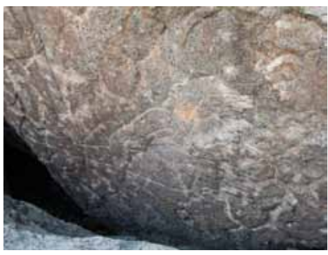
Fig. 2: Detail of the seated figure in Chalcatzingo Monument 2.

and capes. Two are shown holding pointed implements, possibly clubs. The last standing figure, by contrast, is holding a staff with vegetal designs perhaps indicating that the sacrifice was linked to agricultural fertility.