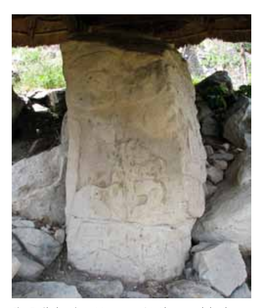
Fig. 5: Chalcatzingo Monument 31.

status?) and is bound at the wrists. This captive figure is also represented with an elaborate armature on his back featuring a backward facing avian mask embellished with serpentine forms (Figure 7a). These details are comparable to the kind of idols and bundles carried by so-called "god-bearers" in the Río Blanco pottery style of Classic Veracruz but also observed in the Early Colonial period Codex Boturini (von Winning 1982:113-115). Although their identity is less clear during the Classic period, later codical sources suggest that Nahuatl "god-bearers" appear to have been closely associated with merchants and migration (von Winning 1982:116-117; Wyllie 2008:245-251). Based on their representation in the reliefs of Chalcatzingo, then, the sacrificial victims were of relatively high status, possibly captive warriors or rulers, suggesting a strong correlation between human sacrifice and inter-community or inter-polity warfare. Echoing later Mexica