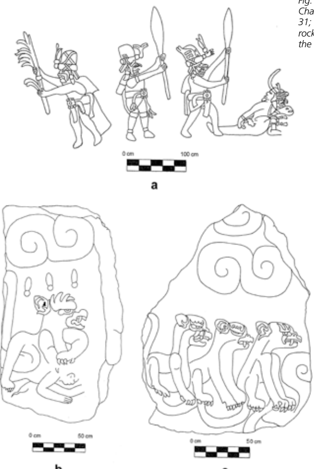
Fig. 7: The iconography of human sacrifice at Chalcatzingo: (a) Monument 2; (b) Monument 31; and (c) Monument 41. Drawings of the rock carvings are not to scale. Drawings by the author.

practices (González Torres 1988:228-231), it seems that some of the Formative period elite victims may have also played distinct roles in some forms of human sacrifice related to their capacity as "god-bearers" and merchants.