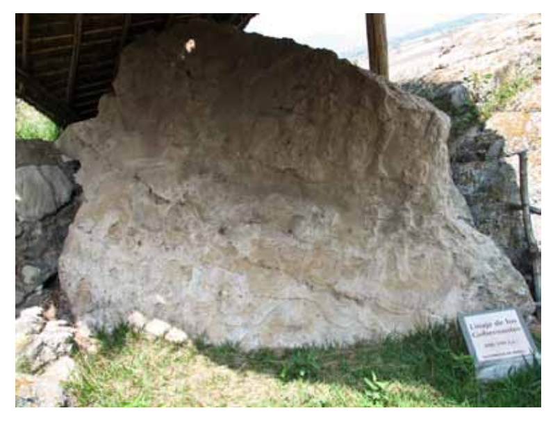
Fig. 4: Chalcatzingo Monument 4.