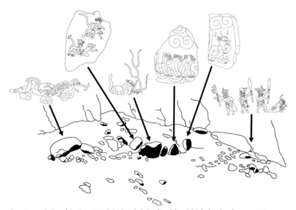
Fig. 1: Panoramic view of the Group B Rock Carvings depicting (from left to right) the location of Monument 5, Monument 4, Monument 31, and Monument 2. Drawings of the rock carvings are not shown to scale. Drawings by the author.

fering the sacrifice, usually rulers or priests (los sacrificadores in Spanish), and the sacrificial victims (los sacrificantes in Spanish).