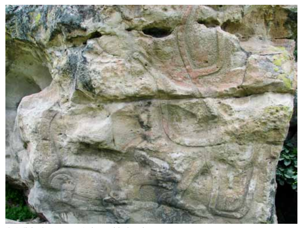
Fig. 3: Chalcatzingo Monument 3.